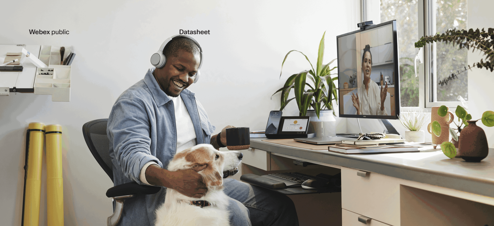
Above: Employee working from home using a Cisco Headset 730 and Webex Desk Camera