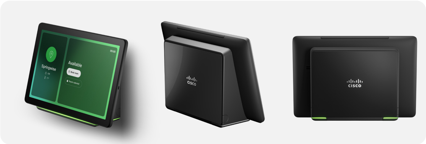
Figure 6: Front, side and rear view of the carbon black Room Navigator for Wall

Note: Many of the products and features described herein remain in varying stages of development and will be offered on a when-and-if-available basis. This roadmap is subject to change at the sole discretion of Cisco, and Cisco will have no liability for delay in the delivery or failure to deliver any of the products or features set forth in this document.