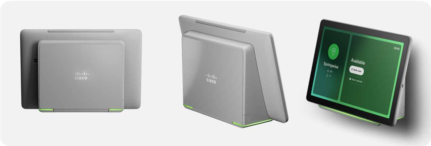
Figure 5: Rear, side and front view of the first light Room Navigator for Wall