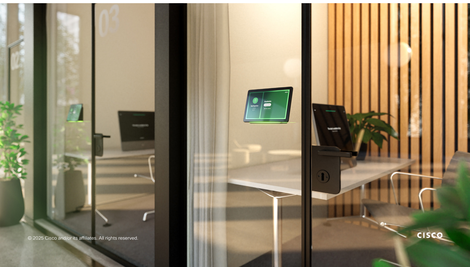
Figure 4: Room Navigator displaying focus room availability with the Cisco Scheduler experience