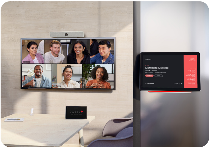
Figure 3: Room Navigator running Appspace as persistent web app

And when using the native Cisco solution for room booking, you can significantly simplify your deployment, lower total cost of ownership and ease management efforts with a single vendor for interoperable video devices, the underlying meeting service, the room control hardware, and room booking software solution.