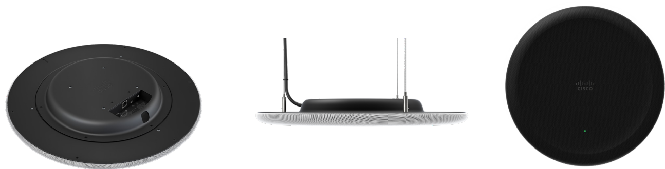
Figure 3: Ceiling Microphone Pro I/O area and rear panel, side view with wire hanging mount kit, and front grille with status LED.