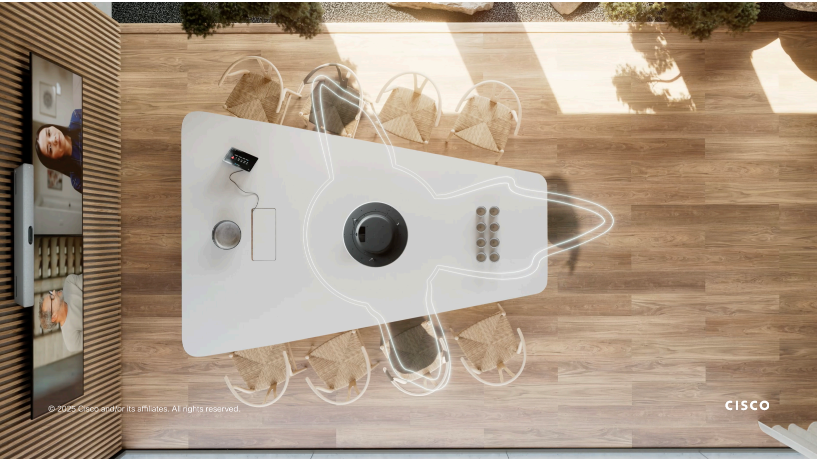
Figure 5: Adaptive beams tracking and capturing in-room participants' voices in a medium meeting room.