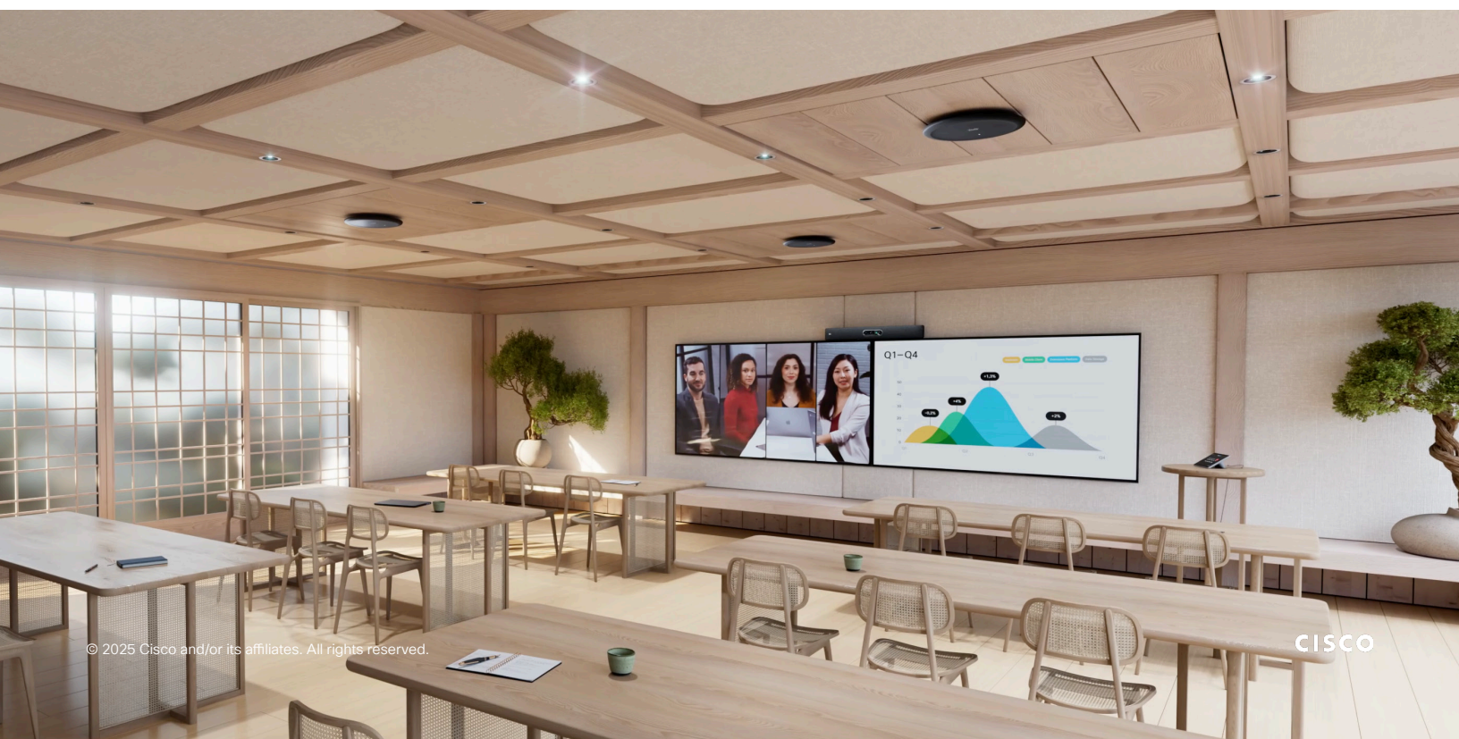
Figure 2: The Ceiling Microphone Pro in Carbon Black with optional ceiling bracket mounting kit.

The Ceiling Microphone Pro is designed to support the circular economy while offering flexible mounting options for a variety of common ceiling types to help you achieve a clean look and feel – for medium, everyday meeting rooms through large, divisible spaces. The unobtrusive, out-of-sight solution provides excellent, tamper-free coverage for an everyday meeting room, and can be automatically combined with other Ceiling Microphone Pros to scale and provide an outstanding acoustic experience in large and multi-purpose room scenarios.