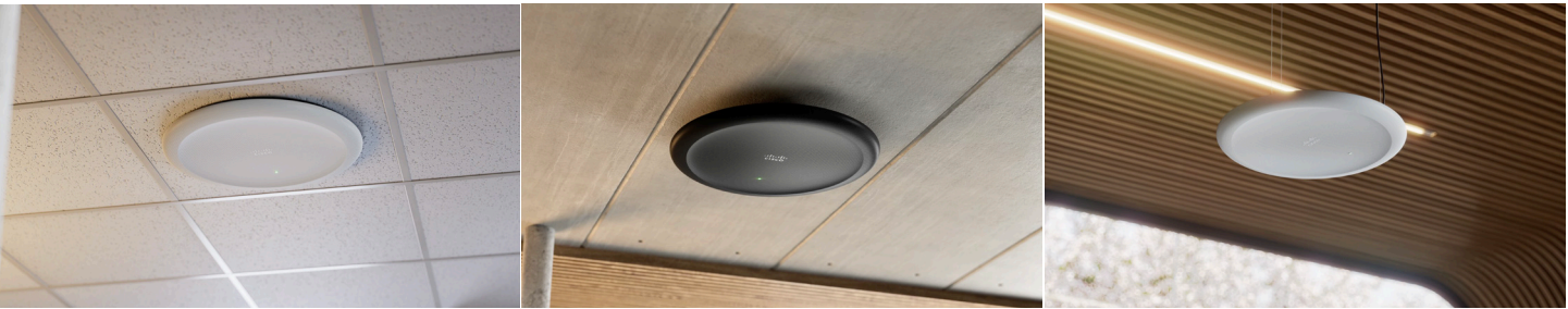
Figure 4: Ceiling Microphone Pro mount options: drop ceiling grid mount, ceiling bracket mount, and wire hanging ceiling mount.