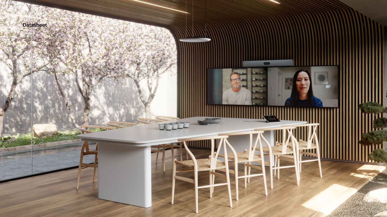
Figure 1: The Ceiling Microphone Pro in Arctic White with optional wire hanging mounting kit.

Cisco Ceiling Microphone Pro is an intelligent conferencing microphone device designed to capture clear, high-fidelity sound in meeting rooms, boardrooms, training rooms and multi-purpose spaces. It supports your modern and flexible workspace layouts with AI adaptive beamforming that intelligently picks up active speakers' voices while following room dynamics and design changes. Better still, this ceiling microphone allows for rapid setup via zero-touch configuration, scalable IP connectivity, embedded signal processing, and versatile mounting options.