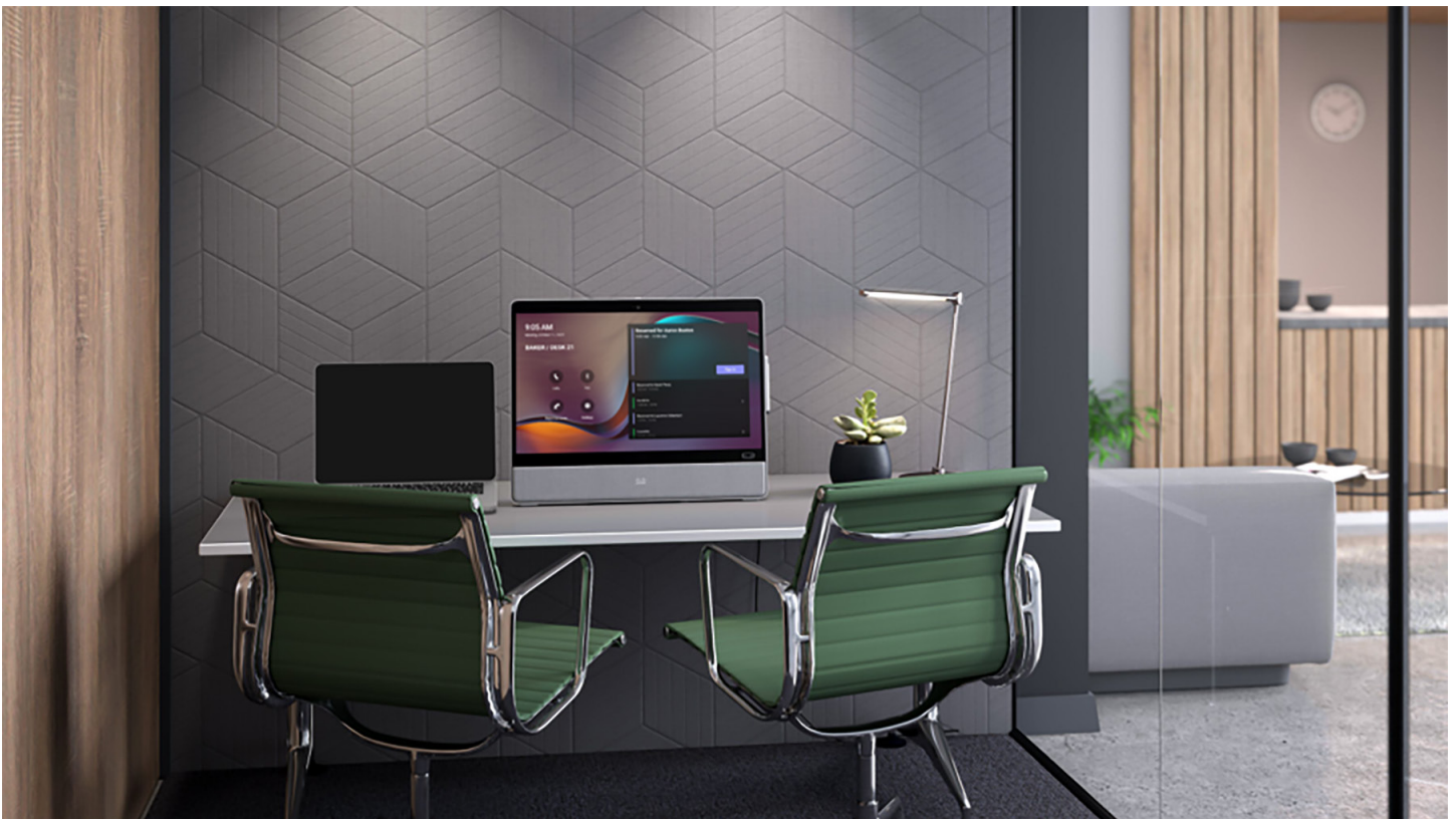
Figure 2. Cisco Desk Pro running the native Microsoft Teams Rooms experience in a huddle space

The Desk Pro is designed for personal desk-based collaboration and focus rooms that accommodate one to two people. Packed with all the workplace and workflow capabilities included within Cisco's larger meeting room devices, the Desk Pro is the ultimate desk-based collaboration device.