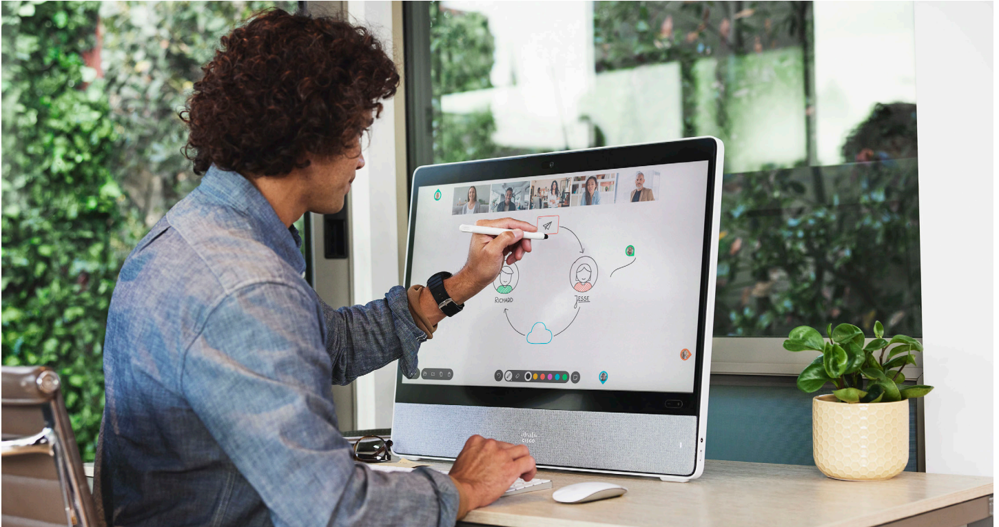
Figure 1. Whiteboarding in a meeting with the Cisco Desk Pro

The Cisco Desk Pro is an industry-leading intelligent collaboration device for desks and shared spaces. Collaborate, co-create, and annotate on an interactive, touch re-direct, 4k-touch display. Whether you set it up in the native Cisco Rooms experience for a Webex-first experience and advanced third-party video interoperability or configure the Desk Pro for the native Microsoft Teams (MTR), the Desk Pro is perfect for any desk.