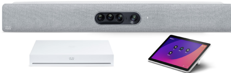
Figure 3. Cisco Room Kit Pro integrator package with Codec Pro, Quad Camera and Cisco Room Navigator.