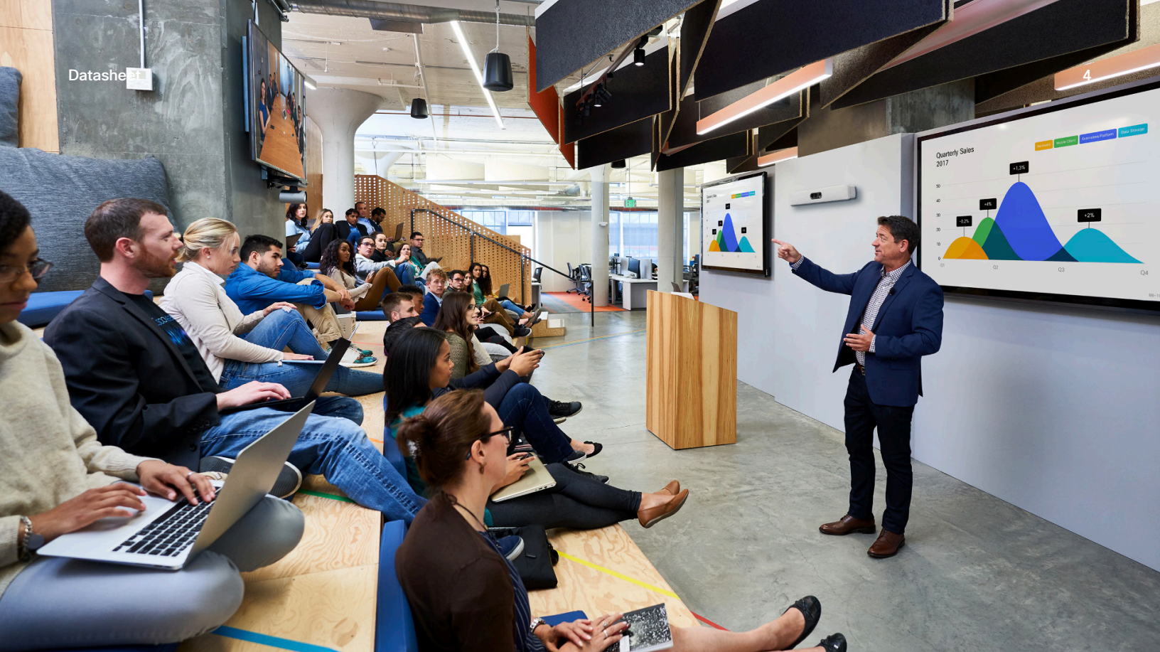
Figure 1. The Room Kit Pro with the Quad Camera, external dual-screens and the Precision 60 pan-tilt-zoom camera deployed in an auditorium.

The Room Kit Pro delivers exceptional 4K video for high-quality video conferencing. The codec's rich set of video and audio inputs, flexible media engine, and support for up to three screens enable a variety of use cases, adaptable to your specific needs. The Room Kit Pro can be registered on premises or to the Webex cloud service.