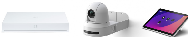
Figure 4. Cisco Room Kit Pro PTZ 4K integrator package with Codec Pro, the Cisco PTZ 4K Camera and Cisco Room Navigator.