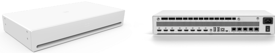
Figure 6. The Cisco Codec Pro

The Codec Pro is also available separately as a standalone unit.