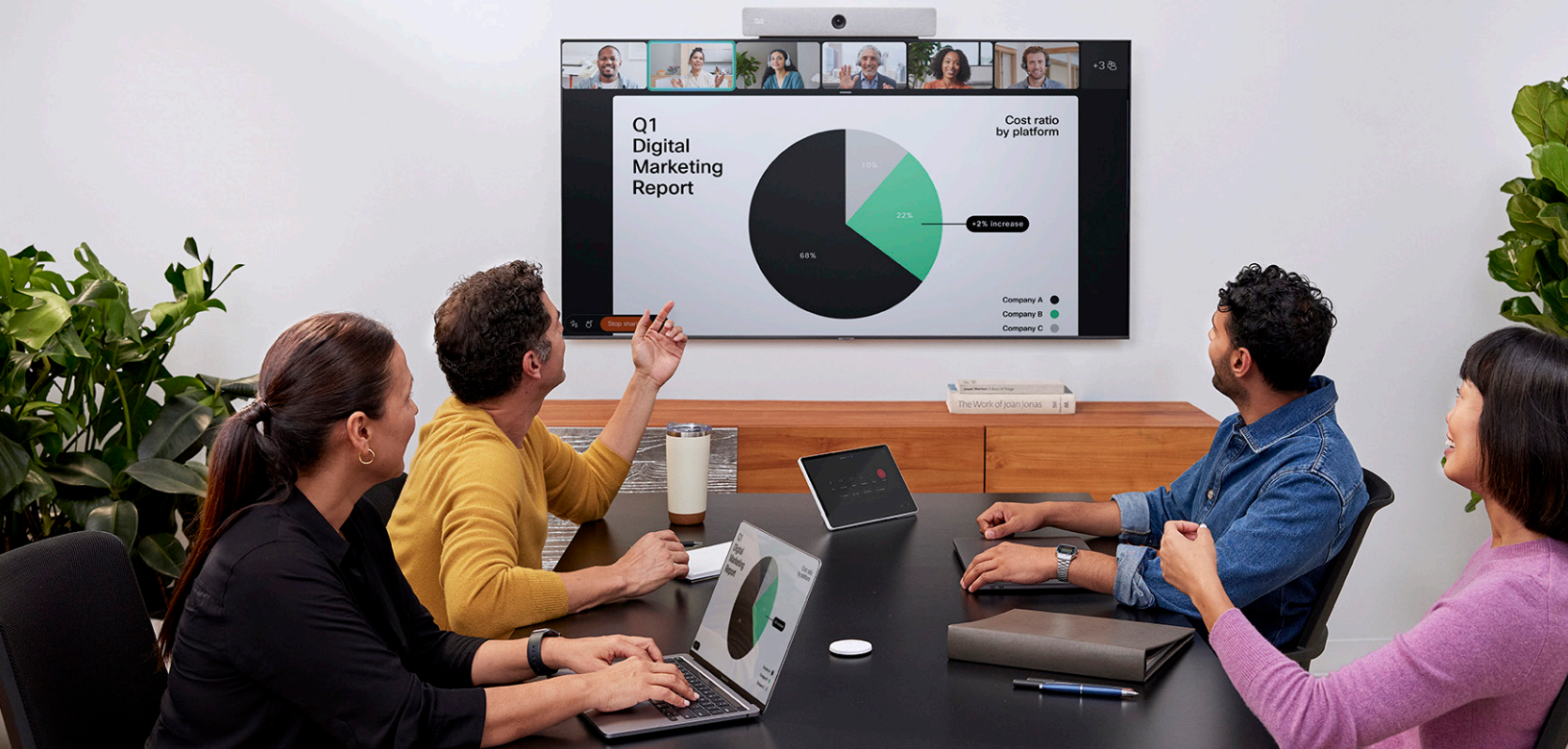
Figure 3. Cisco Room Bar used for video conferencing and wireless content sharing in a small meeting room