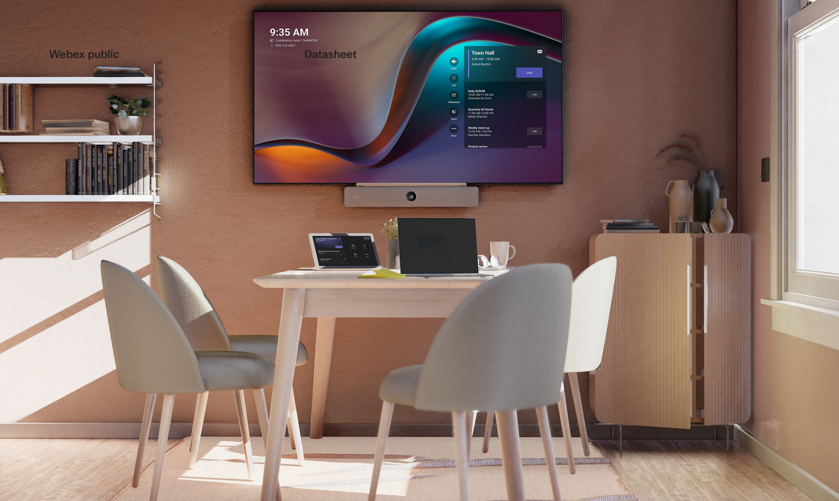
Figure 5. The Cisco Room Bar solution bundle running in native Microsoft Teams Rooms mode in a small huddle space