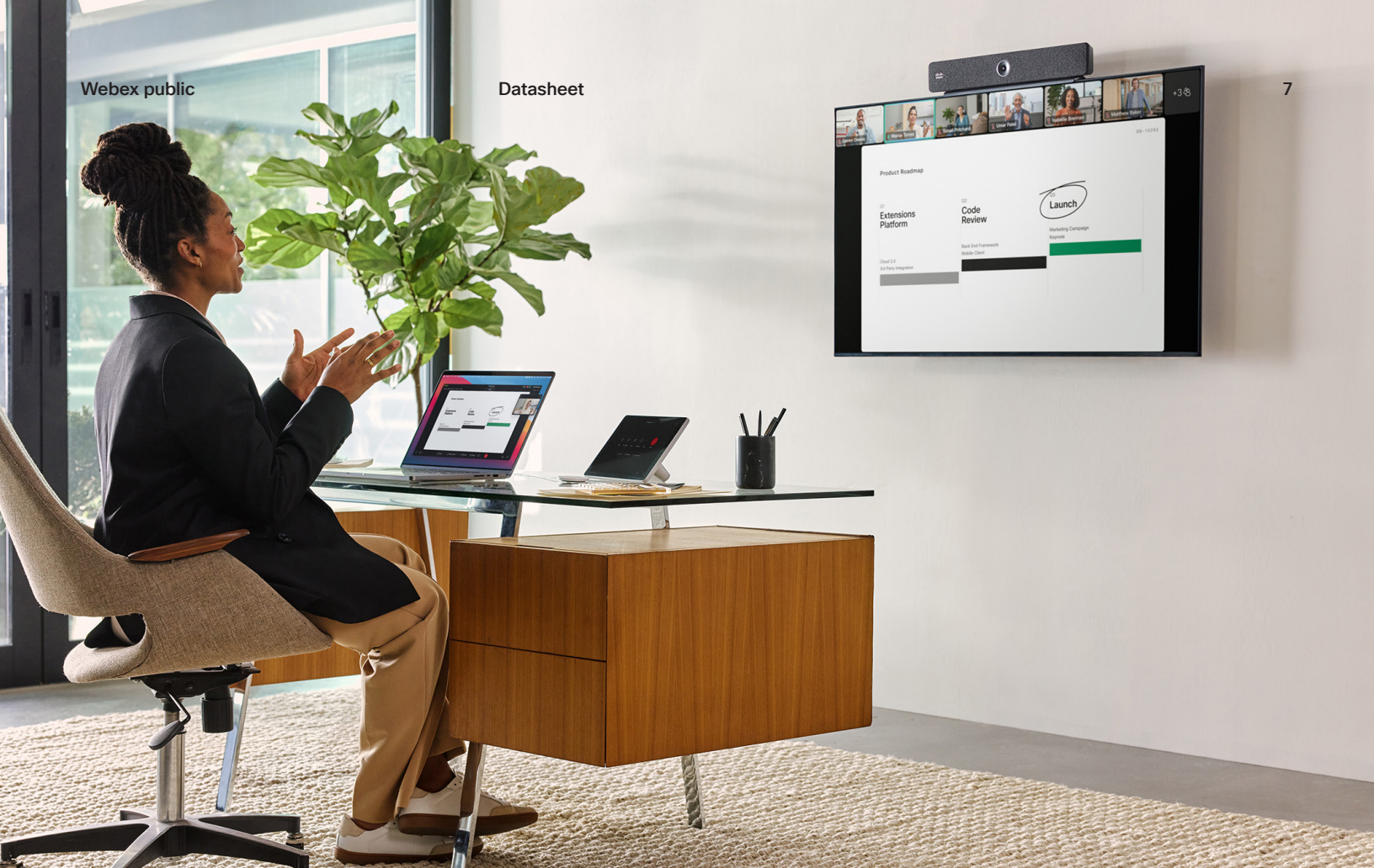
Figure 4. Cisco Room Bar used for video conferencing and wireless content sharing in a dedicated office