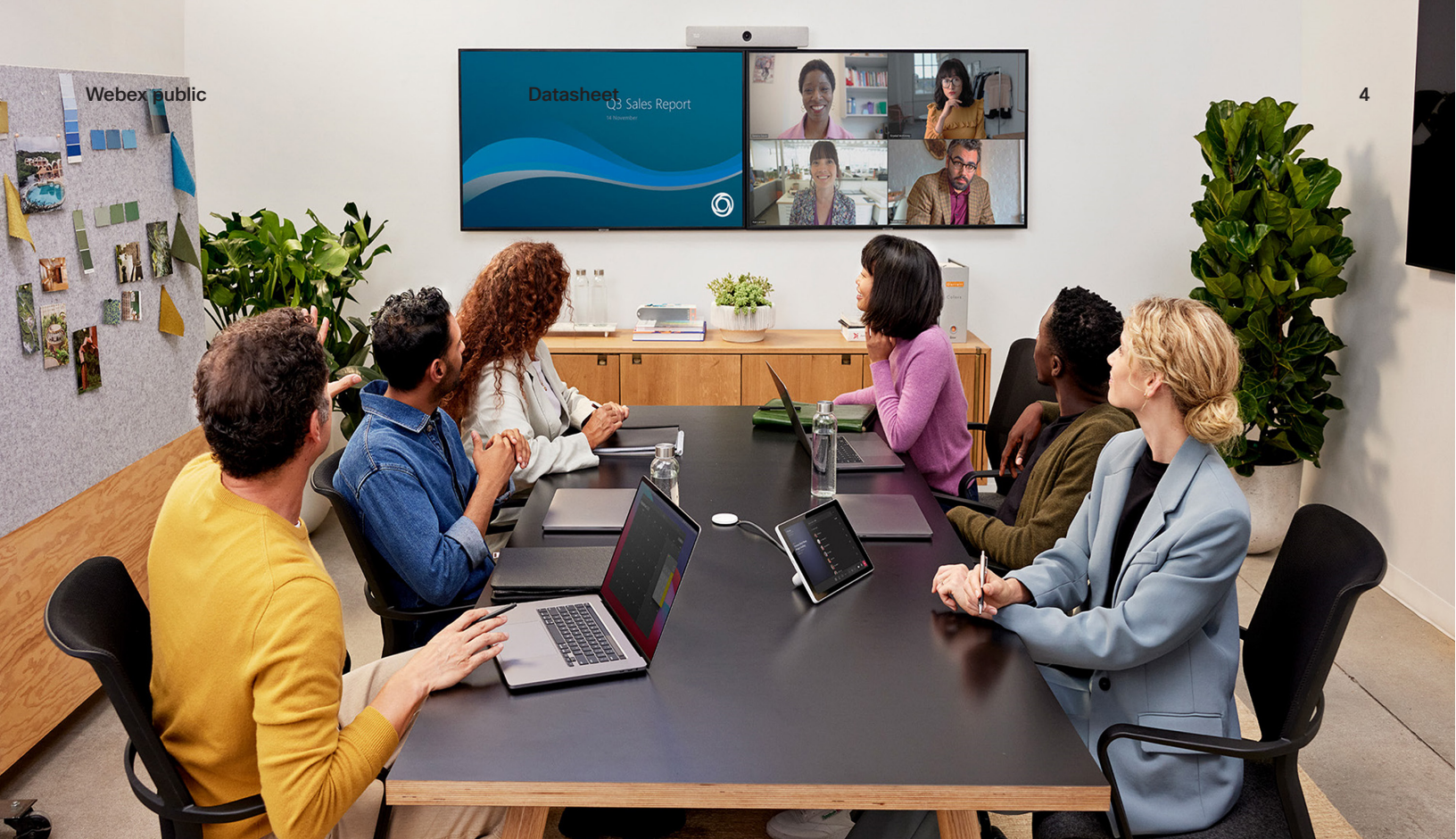
Figure 2. Cisco Room Bar and the tabletop Cisco Room Navigator running the native Microsoft Teams Rooms experience.